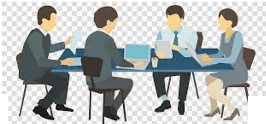
Participants in a meeting room