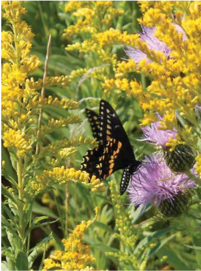
Black Swallowtail, by Susan Hoffman